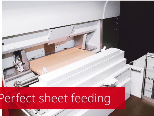
Perfect sheet feeding