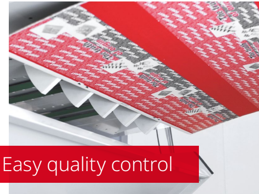
Easy quality control