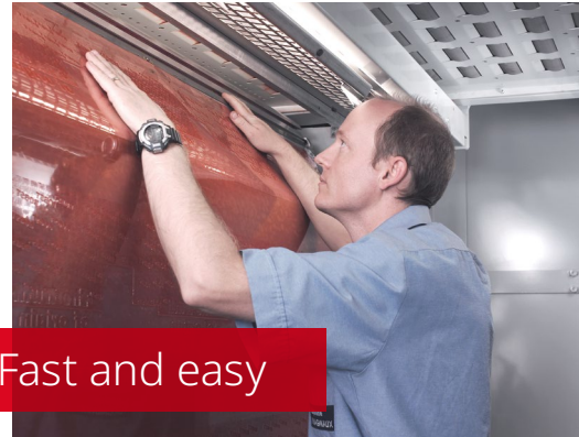
Fast and easy