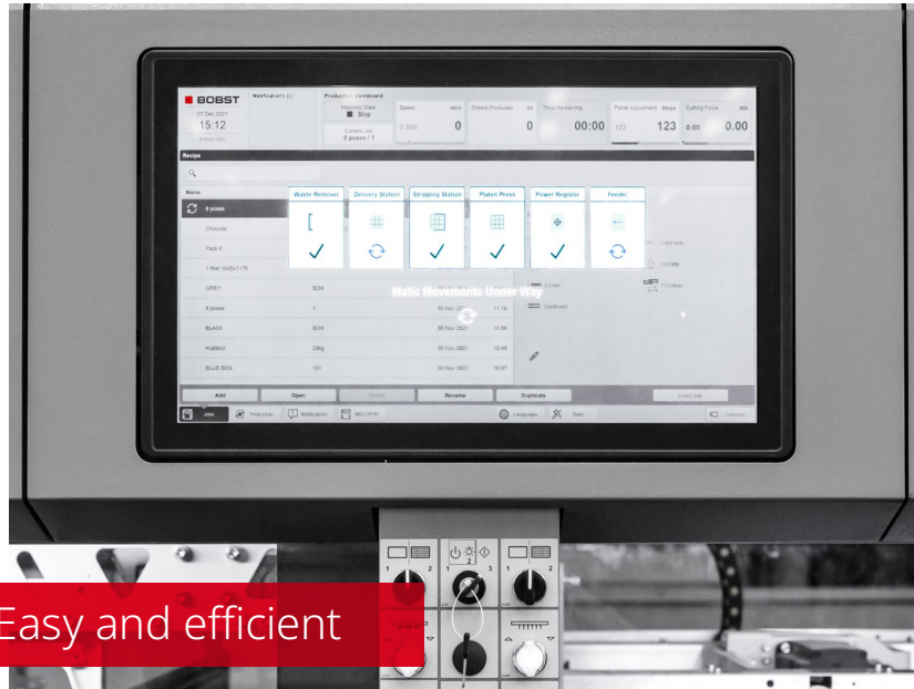
Easy and efficient